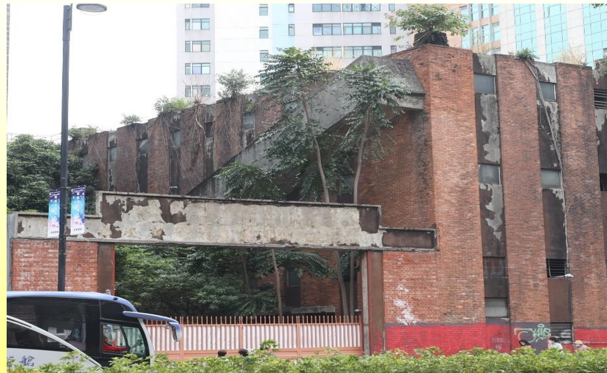
西立面（面向內庭） West elevation (facing courtyard)