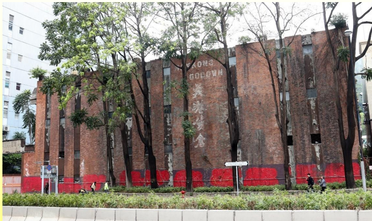
南立面（面向青山公路荃灣段） South elevation (facing Castle Peak Road – Tsuen Wan)