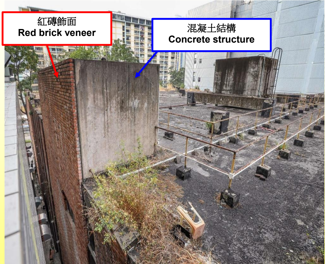
東立面 East elevation